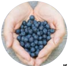
Looking after yourself